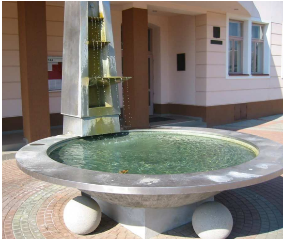
Public fountain – Velké Pavlovice